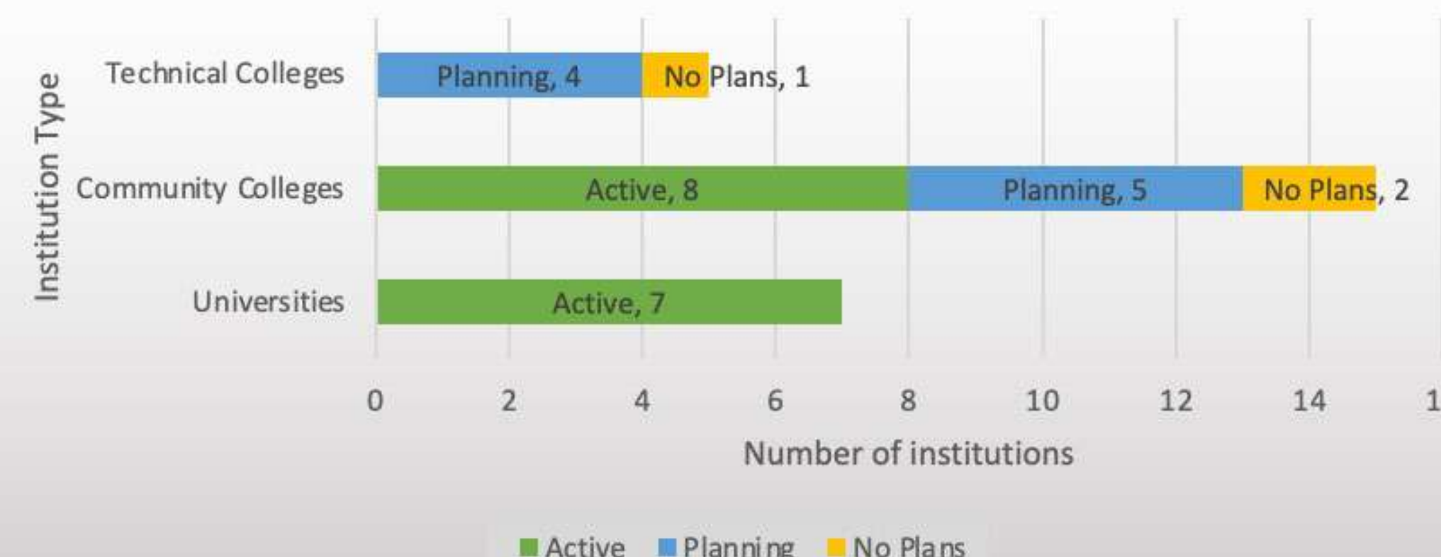
KBOR Institutions with an OER policy, program, or committee