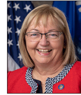
Joan Ballweg Senator; Majority Caucus Vice-Chair WI State Legislature