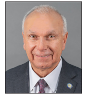
Jerry Cirino State Senator; Chair, Senate Workforce & Higher Ed Committee Ohio Legislature