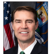
Sean Mcann State Senator; Chair, Univs & Comm Colls Approps Subcommittee MI Legislature