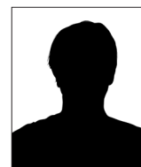
Vacancy MiLEAP (Alternate)