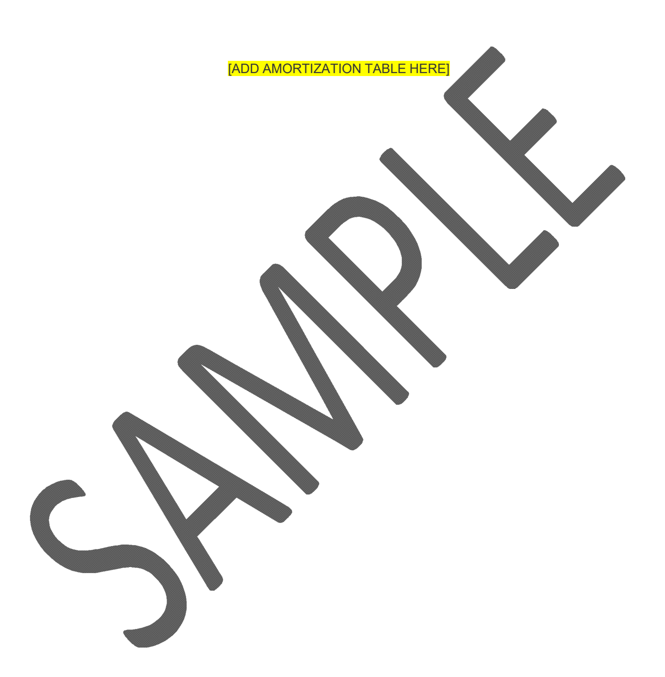
Exhibit A Payment Schedule